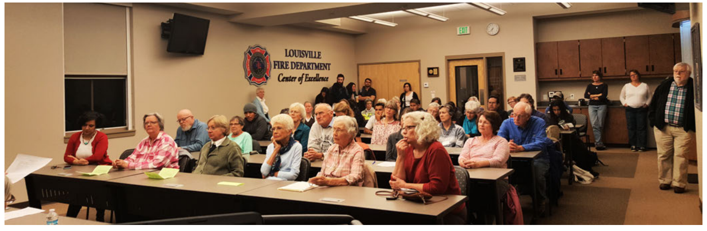
The attentive audience at the Community Conversation on Non-Citizen Rights, 15 November 2016, at the Louisville Fire Department.

The November 28 session at Frasier was also well-attended.